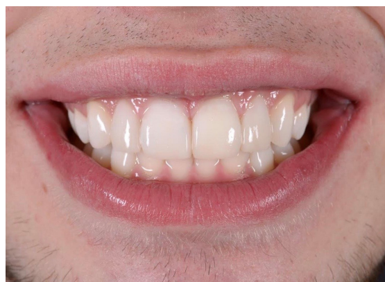
Figure 11: Venus Diamond consistently produces a superior finish

Kulzer Venus is my composite of choice for anterior cases, due to its outstanding aesthetics and strength. I genuinely believe that no other brand of composite can offer such an effective combination of both qualities. ▶