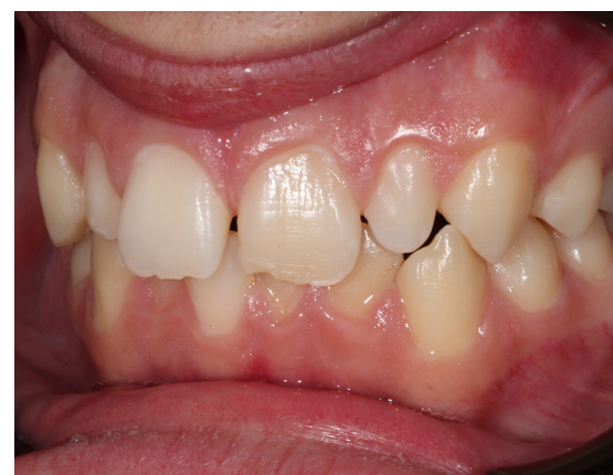
Figure 7: An anterior crossbite was discovered on the LL3