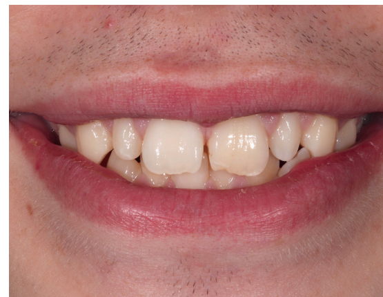
Figure 2: Front-on smile view