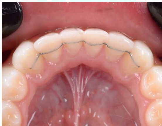
Figure 17: Venus Diamond Flow was used for its excellent strength and flowability to bond the lower wire retainer