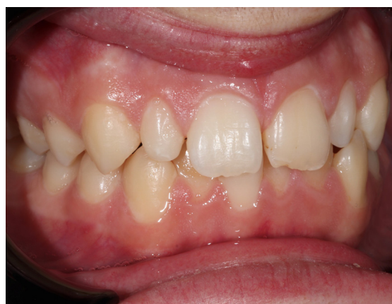
Figure 5: A class I incisor relationship was observed, with a molar relationship of 0.5 unit class III on the right and left