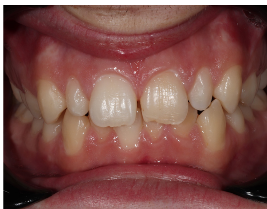
Figure 6: The patient had an overbite of 60% overlap