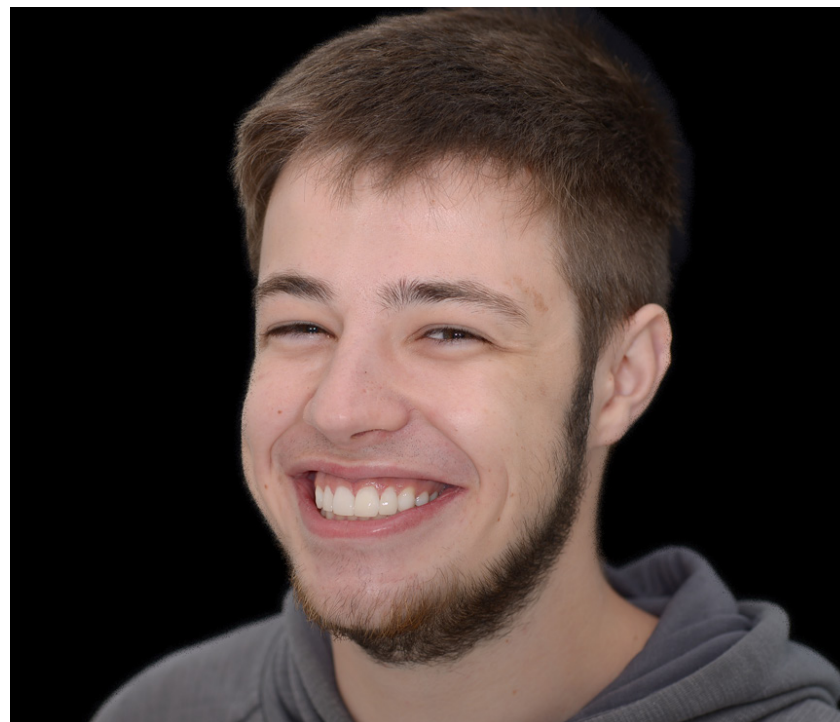
Figure 21: The patient was ecstatic when he saw the result