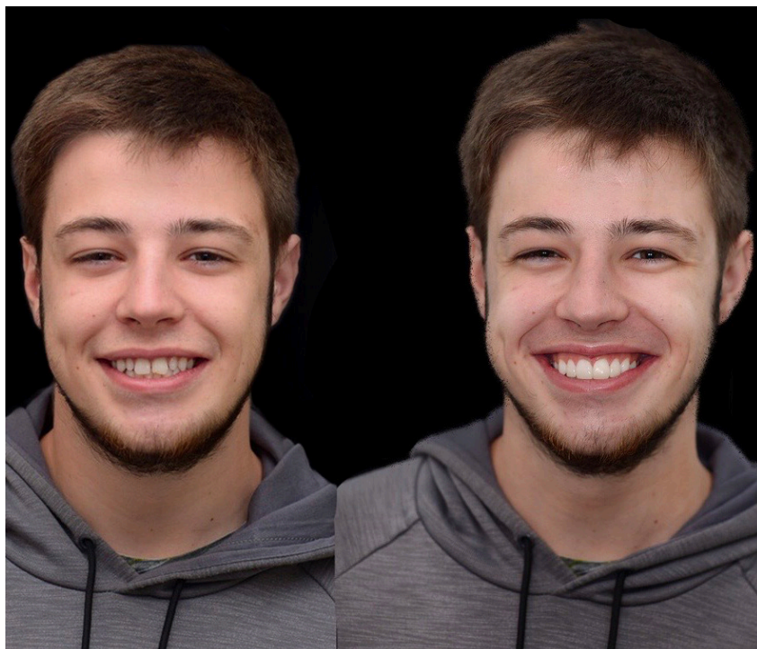
Figure 20: In just over four months, the patient's concerns were addressed, with creation of a more symmetric, harmonious smile