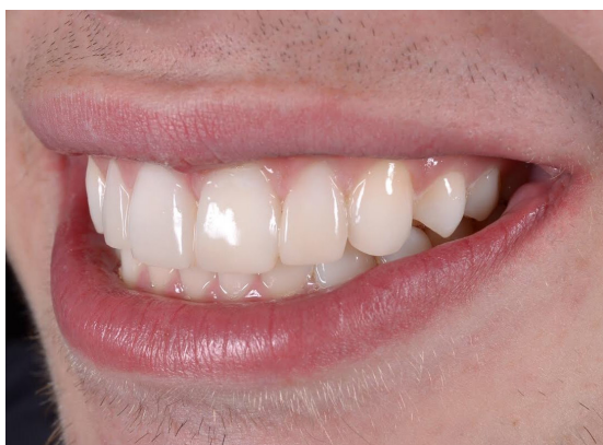
Figures 12 and 13: Once the UR1 shape was satisfactorily completed, the process was repeated on the remaining teeth