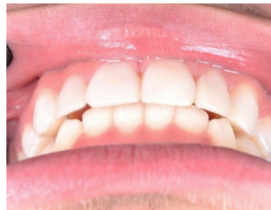
Figure 19: The dramatic transformation was quickly achieved with a conservative approach

Venus Diamond's firmness enables placement of the individual layers freehand without the material slumping, and it consistently produces a superior finish (Figure 11).