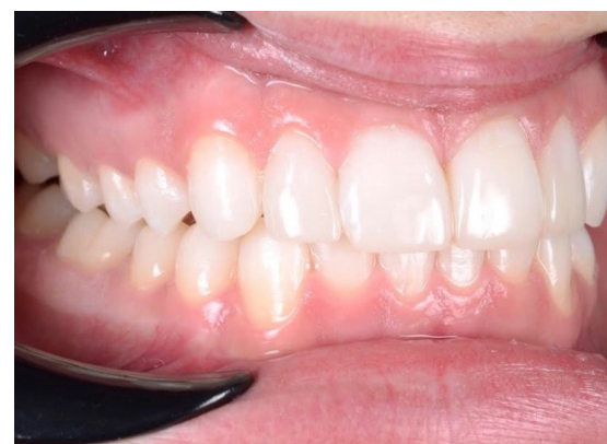
Figures 14, 15 and 16: The front six teeth were polished using All Surface Access Polishers (ASAP) wheels and a felt wheel with polishing paste to create a high lustre