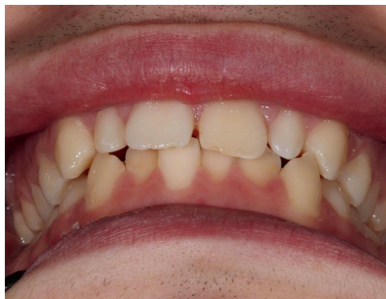
Figure 8: The lower midline had shifted to the left by 1mm