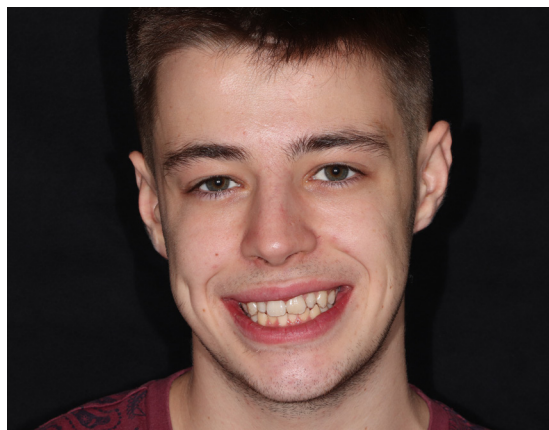
Figure 1: The patient was self-conscious about the gaps in between his teeth, as well as their irregular shapes and colour. He also didn't like his crooked lower front teeth

As the posterior segments were satisfactory, it was agreed to carry out anterior alignment orthodontics. The patient simply wanted to improve the six anterior upper and lower teeth (Figures 9 and 10).