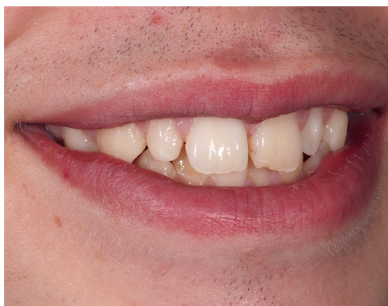
Figures 3 and 4: Side-on smile views