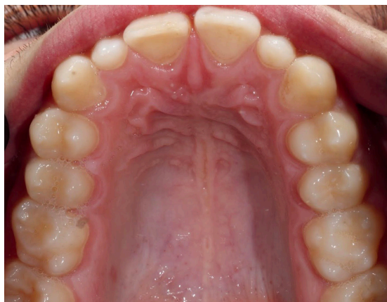
Figures 9 and 10: Crowding of 2.8mm was recorded in the lower arch. The patient wanted to improve the six anterior upper and lower teeth