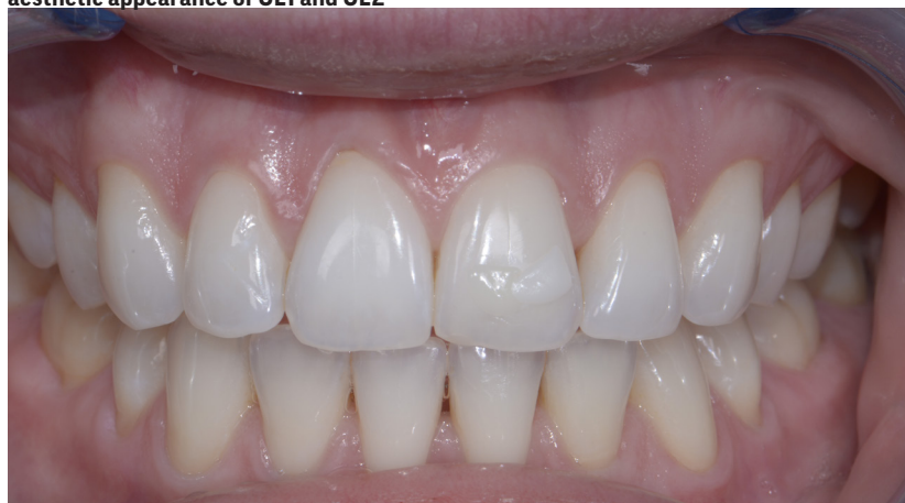
Figure 3 and 4: Venus Pearl B1 on the mesial aspect of UL1 was the closest matching