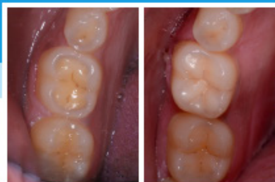
Day of placement