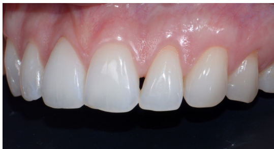
Figure 5: Retracted photographs with a black contrast strip were also taken to check the incisal translucency