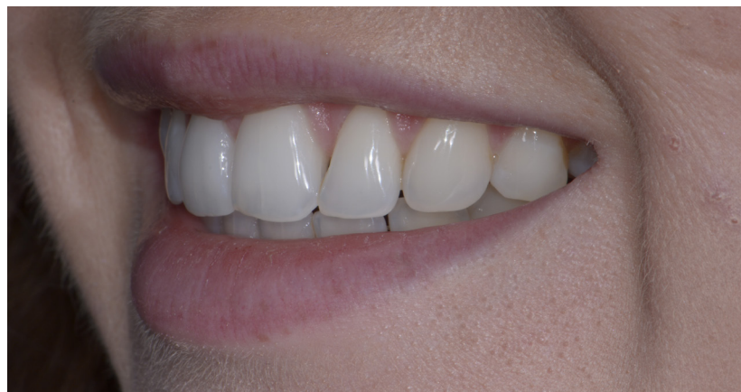
Figure 2: A black triangle was visible between the UL1 and UL2