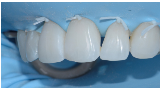
Figure 6: Floss ties around the anterior teeth were used to stabilise the dam