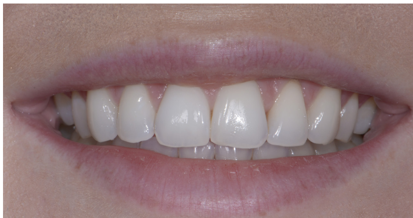
Figure 1: The patient was keen to have composite bonding carried out to improve the aesthetic appearance of UL1 and UL2

A minimal 1-2mm bevel preparation was carried out on the mesial aspect of the