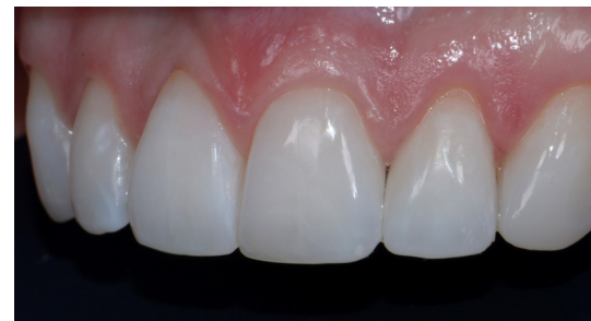
Figure 7: Venus Pearl was used to create the new mesial contour of the UL2 and improve the distal form of the UL1

UL1 and then the UL1 and UL2 were particle abraded with Aquacare aluminium oxide 29 micron powder to remove biofilm and increase the composite bond strength.