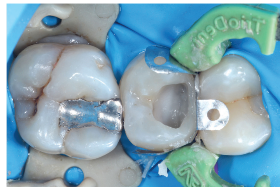
Figure 4: Heraeus Kulzer's Venus Pearl A2 shade was applied to build up the mesial wall