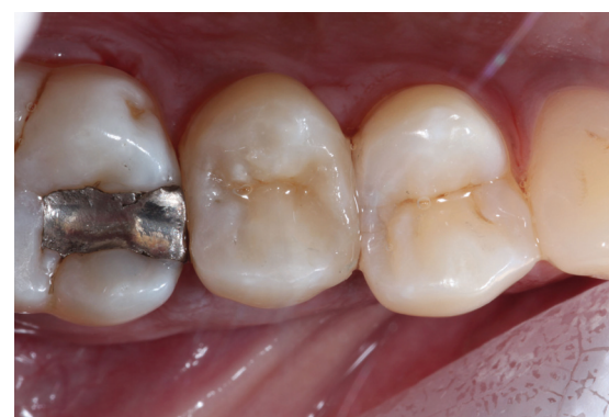
Figure 6: The patient was delighted with the result after having endured an unsightly amalgam filling for years

As she was concerned about the appearance of the tooth, the patient did not want an amalgam filling and decided to have the composite restoration