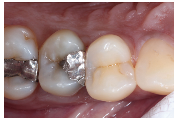
Figure 2: The UR5 filling was very visible when she smiled and the dark appearance made her self-conscious