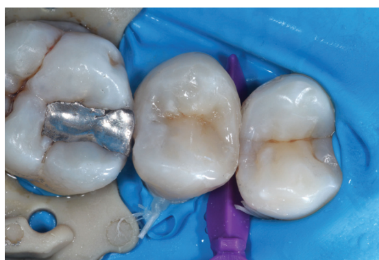
Figure 5: Separation of the masses was achieved by creating fissures down to the dentine layer and then stain was applied