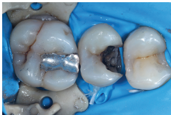
Figure 3: The old amalgam and caries were removed following rubber dam placement